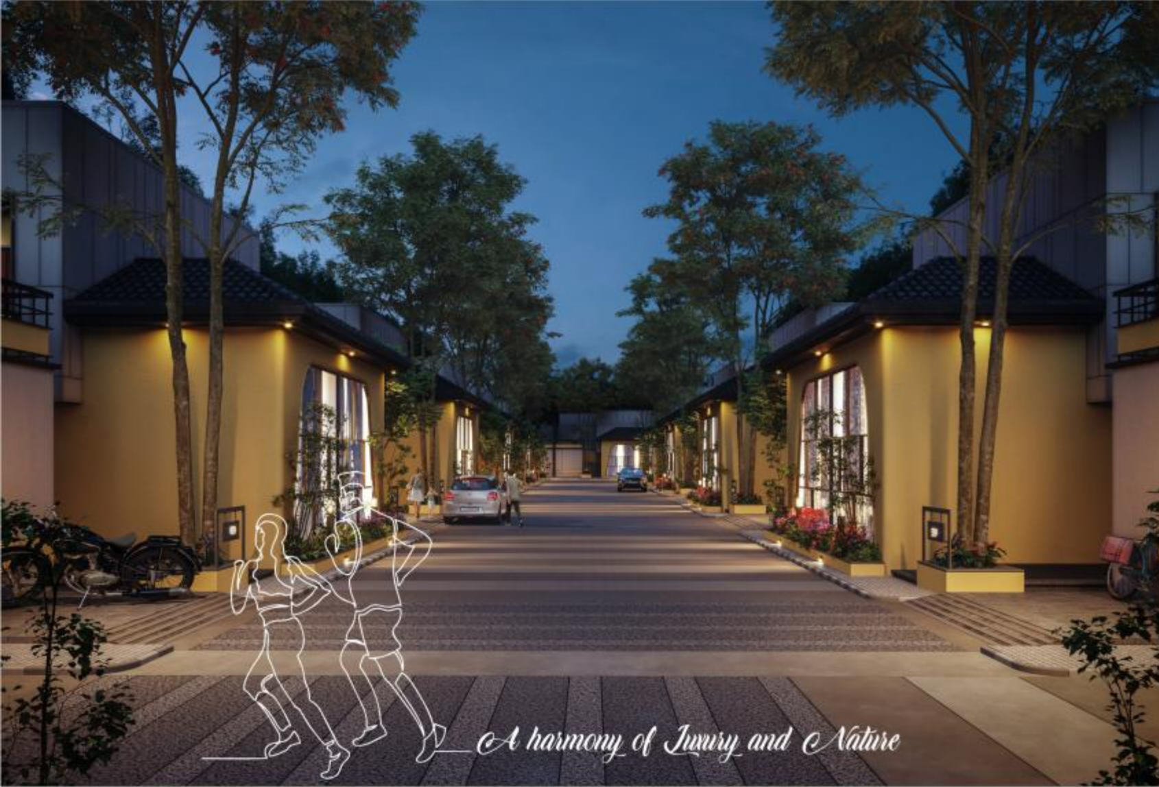
A harmony of Luxury and Nature